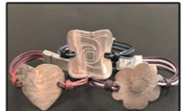
Wrapped Around You Leather Silver Bracelet

LUNA LAYERED SILVER PENDANT CAT BURTON 2PM - 6PM FEES: $115 BALBOA ROOM 3