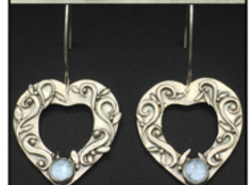
Secrets of the Heart Fine Silver Earrings