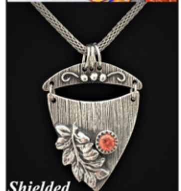
Shielded Fine Silver Pendant