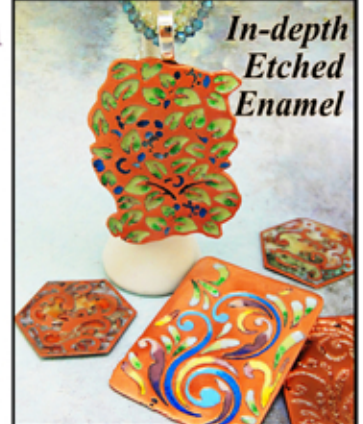
In-depth Etched Enamel