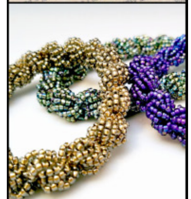
Shell Spiral Bracelet