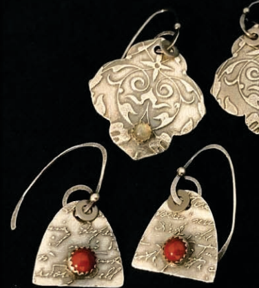
Simply Elegant Earrings