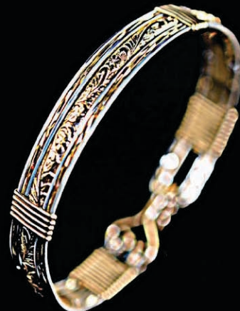
Elegant Pattern Wire Bracelet