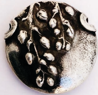
Metal Clay Lentil Bead