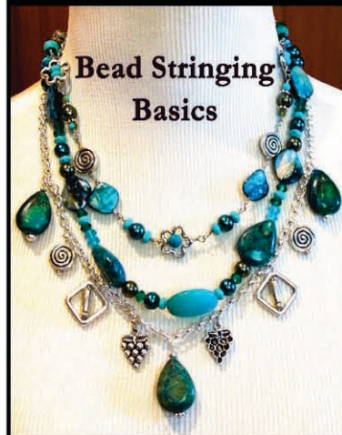
Bead Stringing Basics