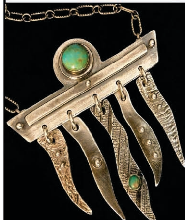
Coat Of Arms Pendant