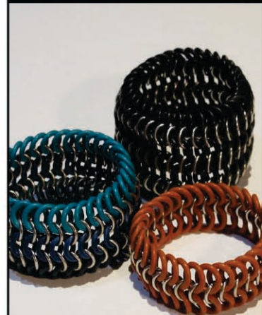
European 4-in-1 Chain Maille