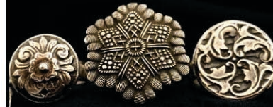
Not Your Mother's Vintage Silver Ring

SUSAN RYZA 5PM - 6PM FEES: $39 BOOTH C182