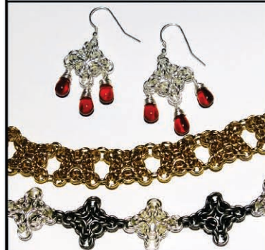
Byzantine Chain Maille