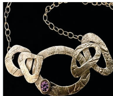
Nebulous Fine Silver Pendant