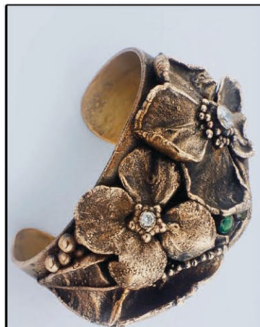
Woodland Fairy Cuff

SUSAN RYZA 5PM - 6PM FEES: $39 BOOTH C182